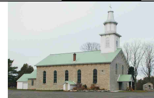
St. Anthony of Padua 4116 County Road 4, RR 1, Centreville