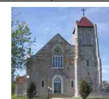
Annunciation of the Blessed Virgin Mary 659 Church St., RR 1 Enterprise